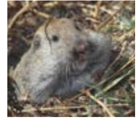
Gopher (inc. pocket)