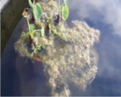
Evidence of algae