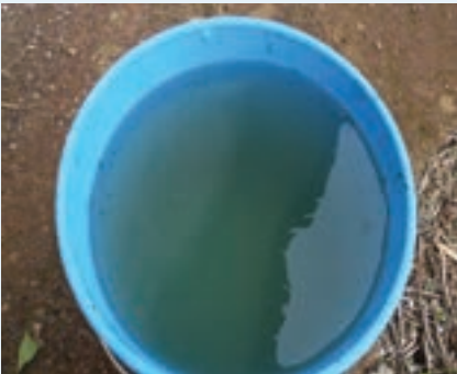
Control sample = murky