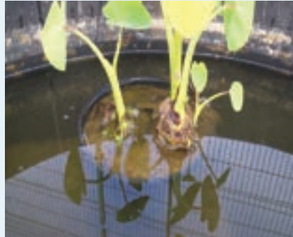
No algae present