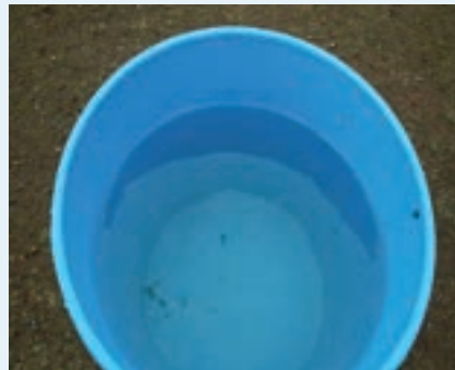
Penergetic w treated = clear